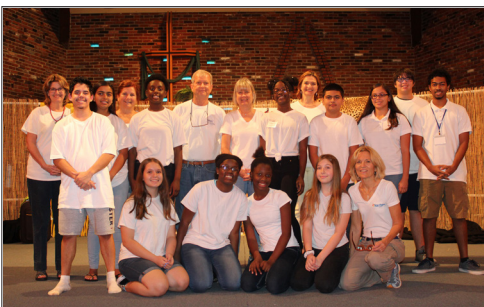
2019 Kentucky Missions Trip: Team Members